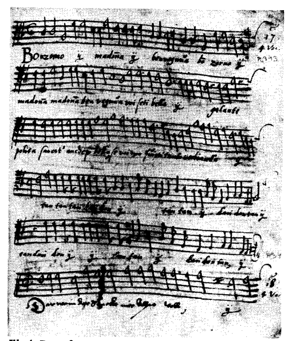
Ill. 4. Page from a manuscript from the Herlufsholm collection written in mensural notation, which in the beginning gave minor difficulties for the encoding of group 32.