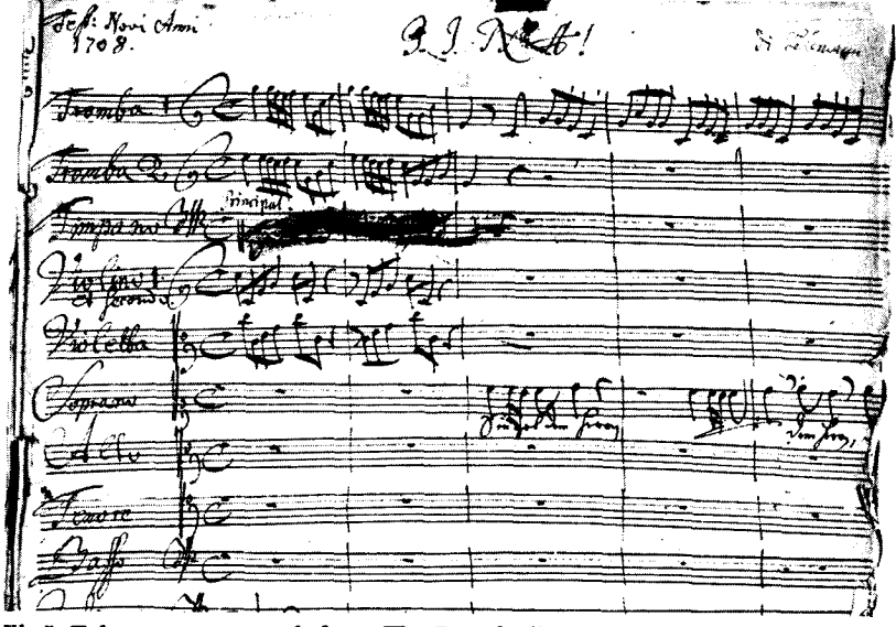
Ill. 5. Telemann autograph from The Royal Library