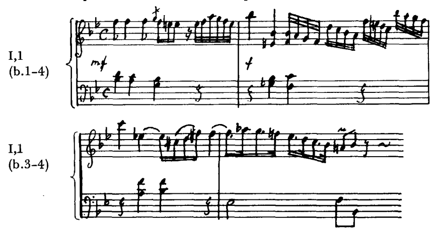
The fast rise-and-fall in b.1, the upward-climbing demi-semiquaver movement in b.2, the punctuation in b.4 as well as later in the movement (and in many other movements), crossing of hands in passage-play, all this has perhaps been inspired

This ritornello is divided into three similarly-composed motive-groups of ca. 3 bars: a(1+2) + b(2+1\frac{1}{2}) + c(3) . Each group consists of a quiet, gentle, piano motive which is abruptly succeeded or interrupted by a fast, running, forte demisemiquaver punctuated movement or by triplets. The contrasts of I,1 of the 57sonatas are compressed into an even shorter period of time: