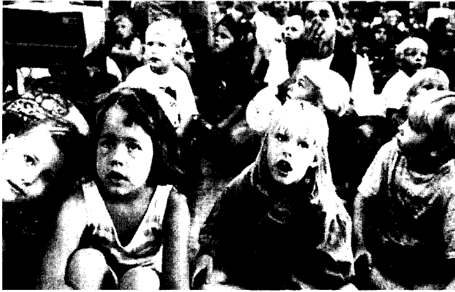
Copenhagen school children singing I østen stiger solen op . They are reading the text from the overhead projector. In the 1990s morning singing in schools is becoming popular again. Photo: Lars Hansen. Politiken 25/8/1995.

munity singing. The tunes are simple. They are kept within the compass of a ninth, most indeed within an octave, and they are formed with stepwise motion or small intervals.